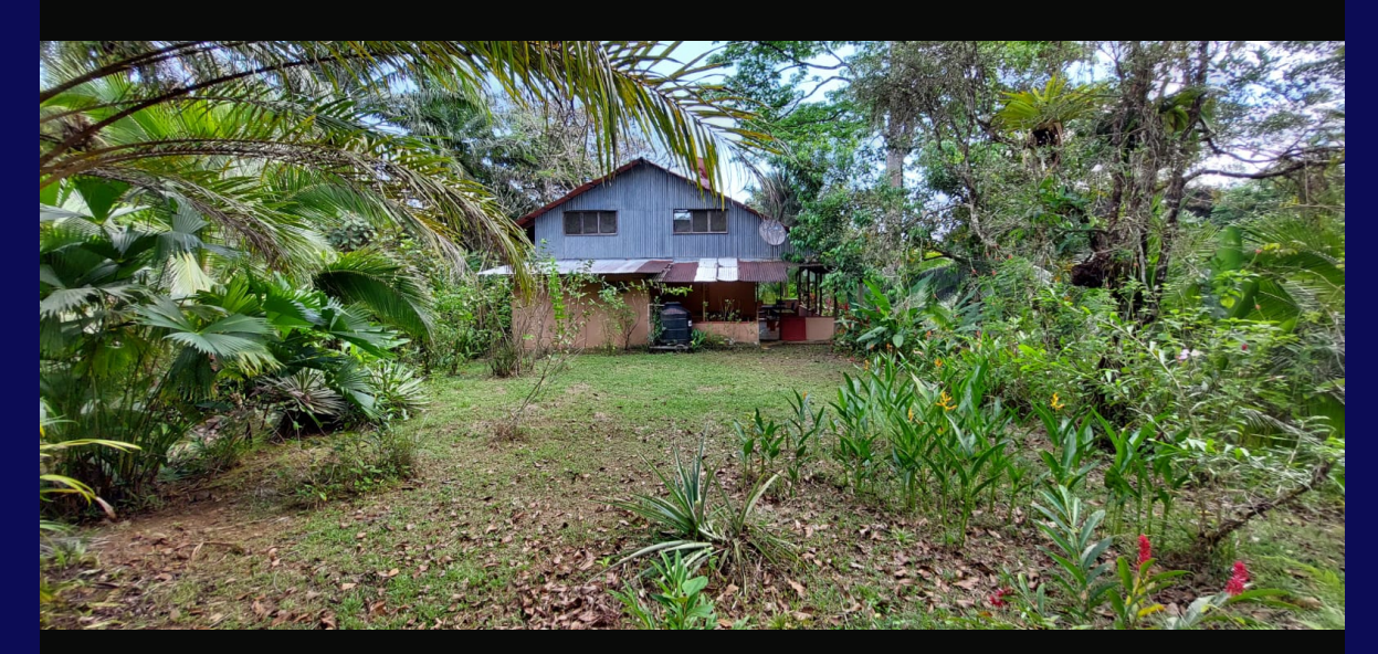
Located just 8 minutes from La Palma, you are a hop, skip and a jump away from groceries, fuel, hardware and other supplies. Puerto Jimenez is twenty minutes in the opposite direction, with even more options plus a medical clinic and airport with ten daily commercial flights to San Jose.